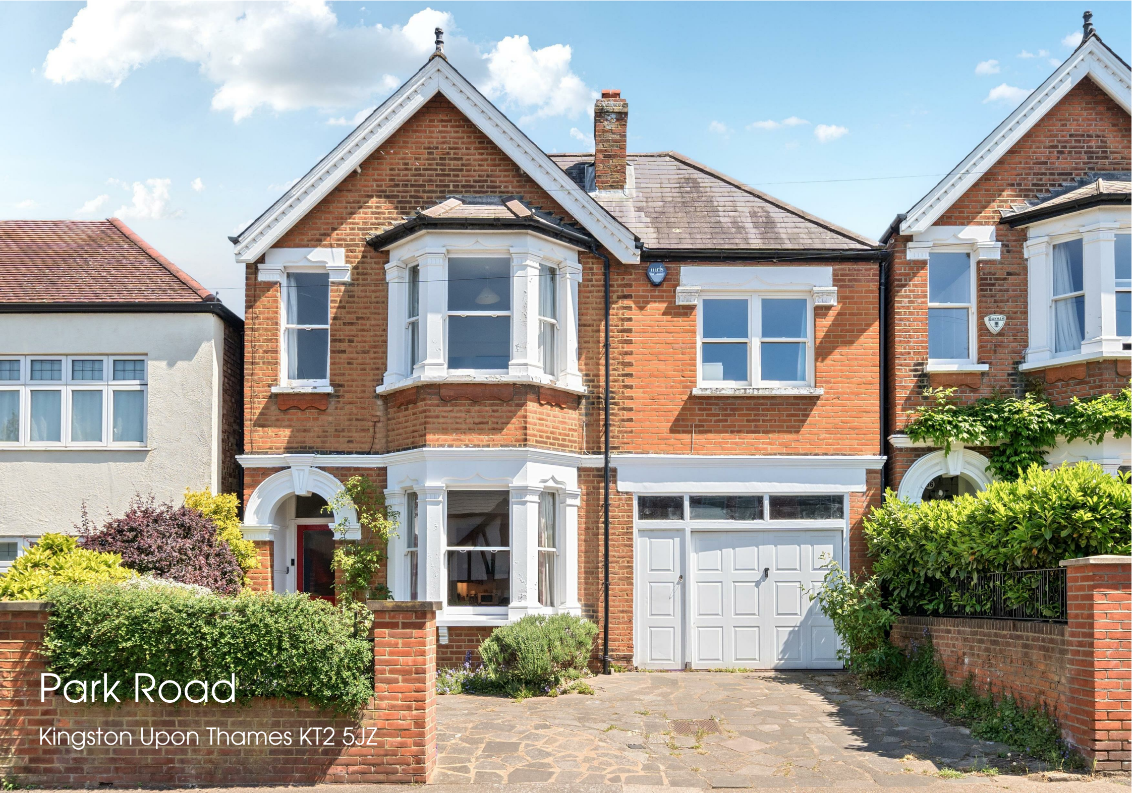
Park Road Kingston Upon Thames KT2 5JZ